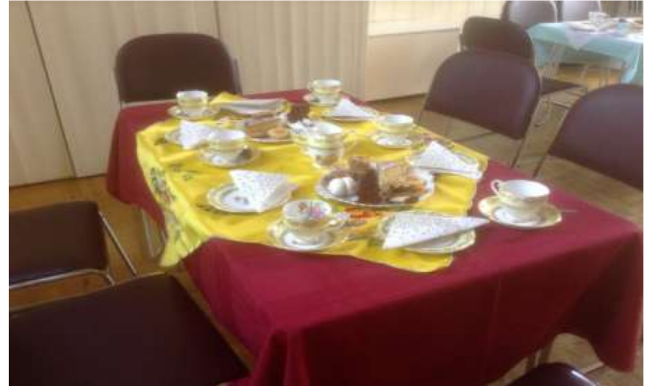
How the Sunday Afternoon Tea table looks before and after!

Once in Egypt then, this is surely where Abram will be demonstrating that through him "all the families of the earth shall be blessed" as God told him. (Gen. 12:3) Not a bit of it! What preoccupies him is Sarai's exceptional beauty and the fact that Egyptian men will desire her. But his worry is not about