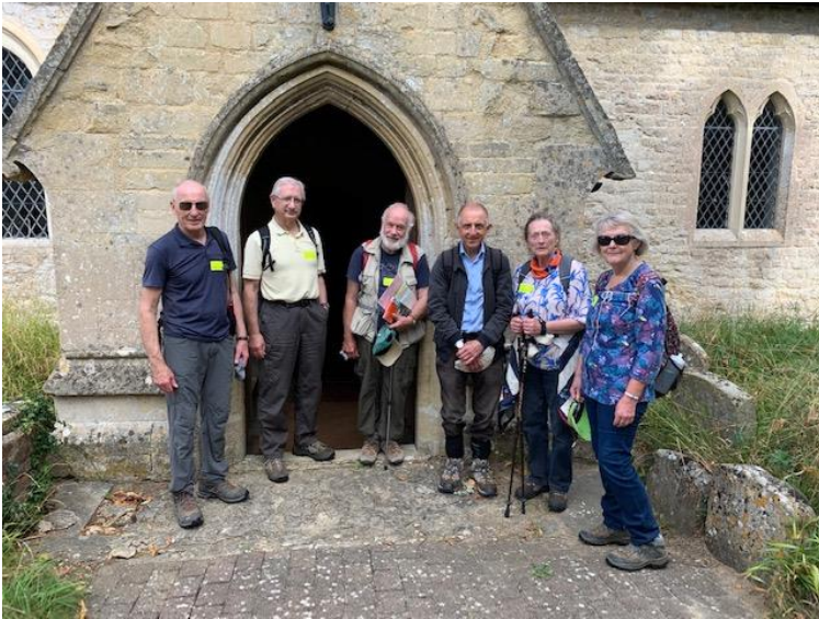
The walking party outside Worminghall Church (less our photographer, Pauline S).

STRIDERS: A group of seven URC walkers set out at 10.30 am from Waterperry carpark to complete a circuit of over seven miles, to include the beautiful historic churches of Worminghall , Ickford (with delightful harvest decorations), Shabbinigton (for our picnic lunch in the churchyard), Waterstock and returning to Waterperry by 3.45 pm (for tea). Most of the walk was on level field paths with extensive views over the countryside to distant hills beyond and included some interesting footpath entries into the lesser known and prettier parts of the villages. Donations and sponsorship from those taking part and others has amounted to an excellent £180 , half of which, plus gift aid, will be shared with our own church for maintenance purposes. See and a photo of