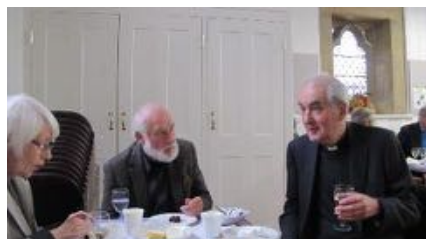
A small selection of photographs taken by Laurence on the day.