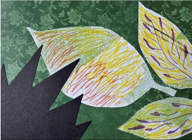
Leaves and Crown