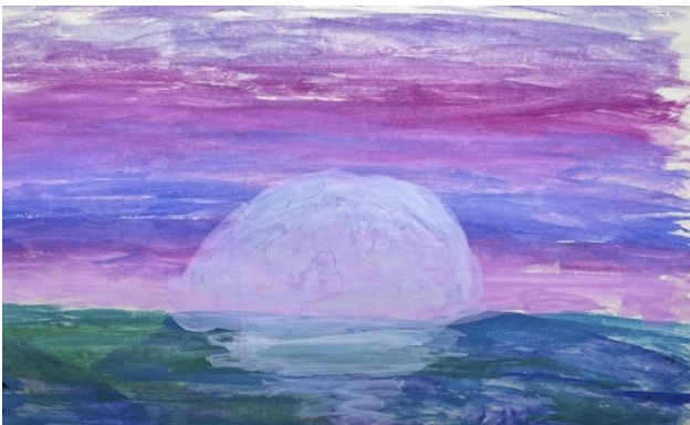
Sea of Forgiveness