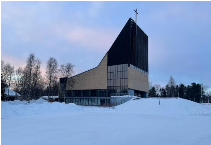
Lutheran Church in Ivalo

Early one morning we caught Chile. Special, being on the far side of the Andes. Cumbia chilena music. Love songs and accordions. Regional songs for town and village people with dry streets, dust and heat. Farmers. Market women. Men in bars. Dancing. Here in a wooden cabin in the snow. We listened - it was like being let into someone else's life.